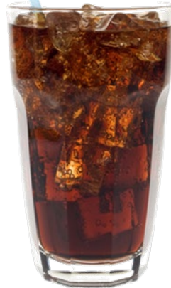
the cold drink