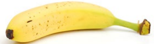
the yellow banana