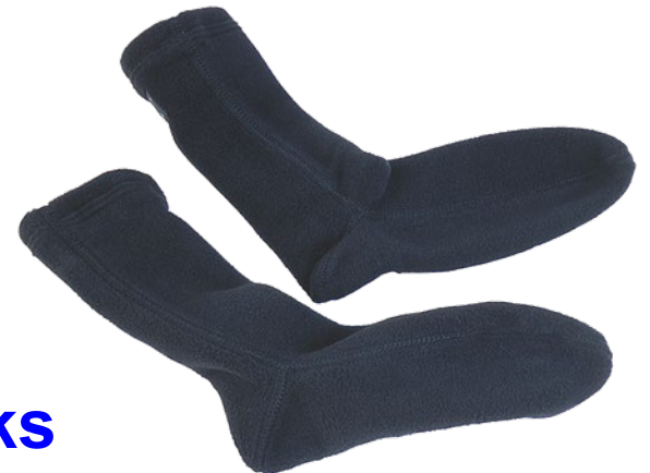
the smelly socks

Can you think of any other adjectives to describe each noun on the slide?