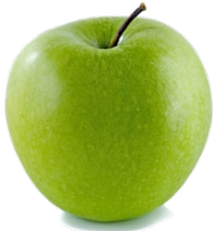
the green apple