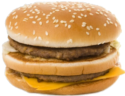
the juicy burger

Adjectives usually come before the noun they describe.